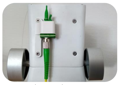
5. Make sure the connector clicks in place