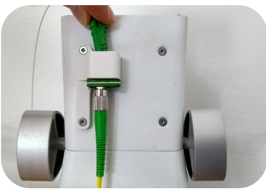
7. To disconnect the probe again, gently push the green lever of the new probe connector