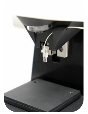
2. Plug the probe to the Piuma probe holder