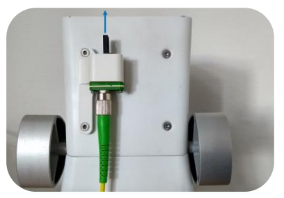
3. Remove the black cap from the adapter & patch-chord