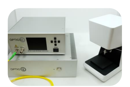
6. Doublecheck the fiber connections before starting the system